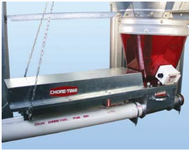
Automatic Boot Slide Actuator System

Chore-Time's Boot Slide Actuator Systems help producers coordinate the use of feed stored in pairs of feed bins so that birds don't miss a feeding. Whether you choose an automatic or a manual boot slide actuator, you get easy operation, a reliable design, and simple, trouble-free operation.