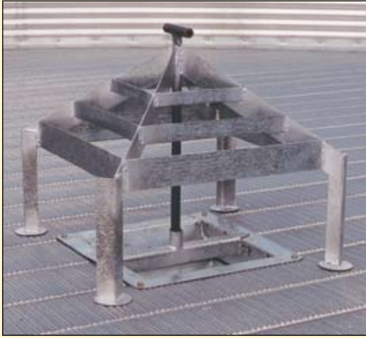
Discharge Guard for Commercial and Stiffened On-Farm Grain Bins