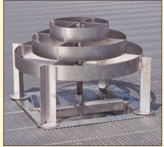
Discharge Guard for On-Farm Grain Bins

Cuts or breaks up chunks of grain threatening to block discharge well. Allows grain to flow around chunks of grain that will not break up, moving chunks away from well opening.