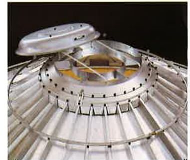
Giant 39-inch (991-mm) fill hole.