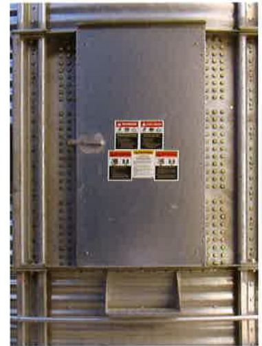
Brock's LATCH-LOCK® Walk-Through Entrance Door for Stiffened Bins.