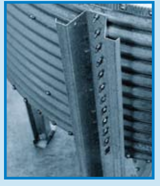
Bin legs are formed from all-galvanized steel for superior fit, durability, and strength.