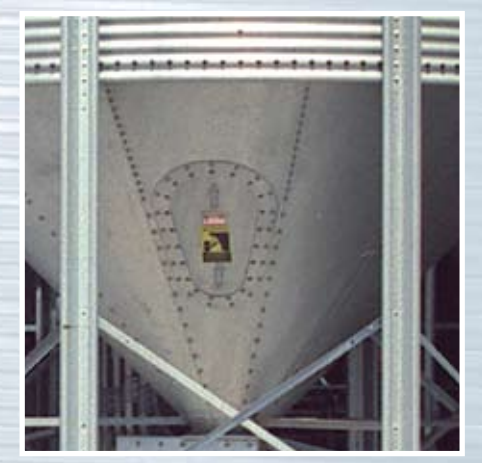
Brock's ACCESS PLUS® Hopper Access Door gives easy access to the interior of the holding bin.