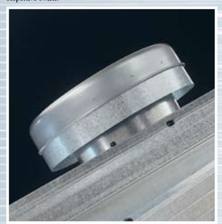
Gravity roof ventilators provide free air movement into the bin. Round mushroom-style (shown) and elbow-style vents are available.