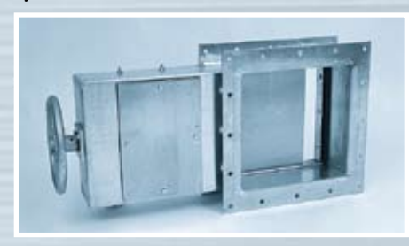
The hopper's discharge opening may be equipped with heavy-duty rack and pinion or roller-style unloading gates.