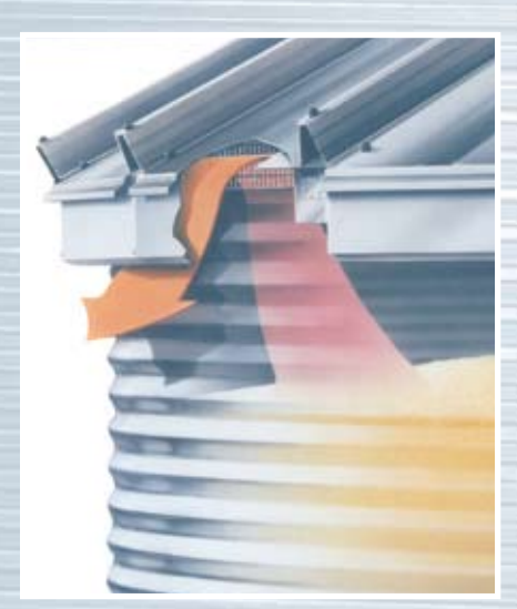
Patented BROCK® Eave-Vent System provides more total bin ventilation and eliminates the need for roof cuts.