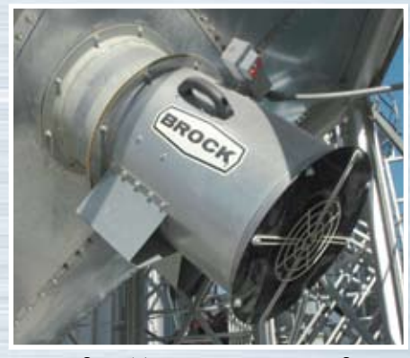
BROCK® Field-Proven GUARDIAN® Fans are designed for maximum in-bin aeration efficiency.